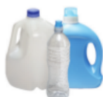
Plastic Bottles & Jugs