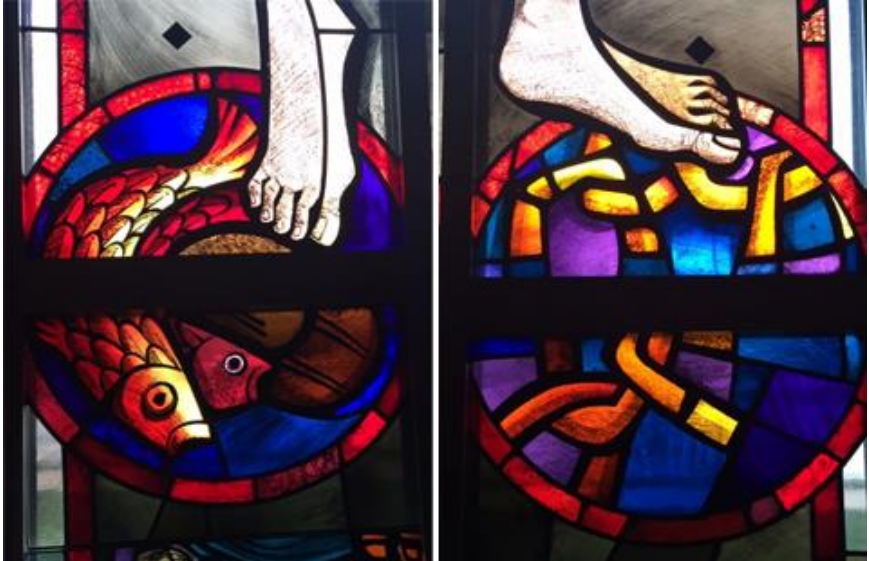
The Jesus Window , Parkway United Church of Christ

Parkway United Church of Christ | April 14, 2022 7:00pm